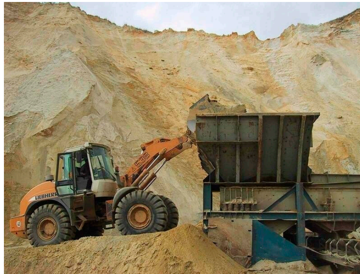
Figure 2. Gold tailings dam, Johannesburg, South Africa.

In the prescription of project management models for the development of new tailings facilities, the guidelines do not even provide a holistic approach for integrating the requirements of the environmental impact assessment (EIA) legislation and the requirements of the South African Bureau of Standards (SABS) Code of Practice [25] (SABS, 1998) during the various project life cycle phases in order to optimize the overall implementation process [21] (Snyman and Brent, 2006).