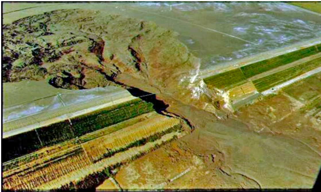
Figure A1. Aerial view of the Merriespruit tailings dam disaster. Approximate volume of the dam = 2.5 million cubic meters. Source: Tailings.info. Available online: http://www.tailings.info/casestudies/merriespruit.htm (accessed on 26 March 2016).

“On the night of 22 February 1994, the 31 m high northern wall of the number four tailings dam of the Harmony Gold mine collapsed. The tailings dam is situated 320 m up-slope of Merriespruit, a suburb of Virginia in the Free State Goldfields of South Africa. More than 2.5 million tonnes of liquefied tailings ripped through the sleeping mining village. Eighty houses were largely swept away and 200 others were severely damaged. Seventeen people were killed. The failure of this tailings dam shocked everybody who followed the unfolding drama of loss of life and destruction of property in the press. At the inquest following the disaster, the judge called this tailings dam a time bomb that was waiting to explode. For the first time in South African history, processed satellite images were allowed as scientific evidence in court. Together with eyewitness reports, all the evidence pointed overwhelmingly to the cause of the failure as being overtopping. The owner, the operator and six of their employees were subsequently found guilty of negligence (contravening Section 37 of the Minerals Act), and heavy fines were imposed. The Merriespruit disaster provided the State and the mining industry with the impetus to ensure the safe disposal of tailings. It also made the mining industry and all those involved with the design and operation of tailings dams take stock of their management and tailing disposal methods”.