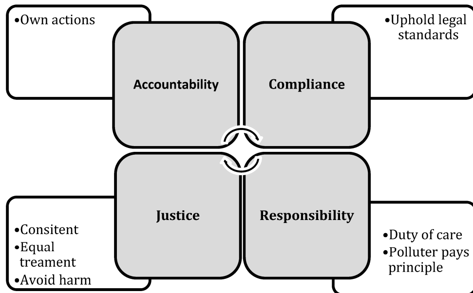
Figure 6. Suggested key elements for an ethical tailings disposal practice in South Africa.

The creation of an ethical culture within the mining companies demands the companies' commitment to understand and uphold the current applicable statutory requirements. Ethical culture in the mining companies guarantees that justice is done for all affected parties and in all circumstances. Figure 6 provides a summary of key ethical elements essential for creating an ethical mining culture.