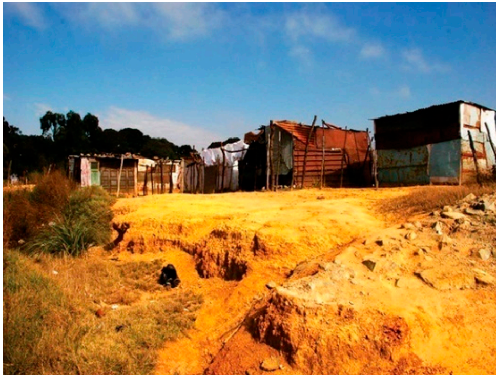
Figure 3. Mining communities in the Witwatersrand goldfields are often built near, or on top of, tailings piles that contain uranium dust.

dams often carry a large burden of toxic metals and other contaminants (Figure 3; [28]). These are exactly why the question of inclusivity (See Section 5.1, this article) is so important for women. Indeed, as McGuire (2003) [27] points out, consultation on the environmental impacts of mining needs to be gender specific to encourage women to discuss issues which pertain to their roles in the provision of health care, education, food security and cultural activities (ceremony) (See Section 5.2, this article).