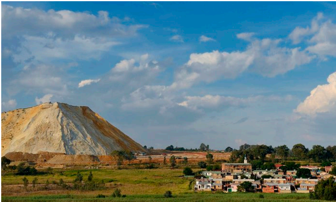
Figure 1. Johannesburg’s Soweto Riverlea neighborhood in the shadow of a gold mine slag heap.

Only a small percentage of the total waste generated can potentially be backfilled into worked-out areas underground, and the bulk of it is deposited in large surface impoundments or tailings dams. According to RSA DEA (2012) [15], many of these dams are unlined and unvegetated (Figure 1). They constitute the largest single source of pollution of the soil, water and air environments in South Africa, including breakdowns in nutrient cycling (See Section 2, this article). Improper handling of tailings can cause the emission of extensive dust, as well as acidification and salinization of soils. The quantitative prediction and integration of these impacts is difficult to address, and the impacts are costly to manage and remedy.